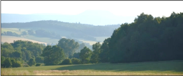
Tabletop Mountains Lower Silesian countryside

BOŻKÓW ~ June 25-July 6 Ready for a memorable and personally satisfying experience in a beautiful part of the world? If so, think about undertaking a 2 week summer conversational English teaching opportunity in the scenic mountains of Lower Silesia.