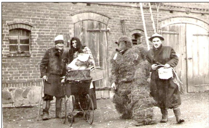
Zapusty w Podmoklach Wielkich - lata 50 Carnival in the Great Podmoklach - 1950

Carnival time is from the end of Christmas until the eve of Ash Wednesday. 'Zapusty' is the old Polish word for this pre-Lenten merrymaking. People go to parties and horse-drawn sleigh rides (kulig). They eat lots of fat rich foods soon to be forbidden. Drunken dancers wake up others and demand food and booze. People wear disguises to protect themselves from the spirits of the dead: a bear for strength, a bison male for power and fertility and a stork for the return of spring.