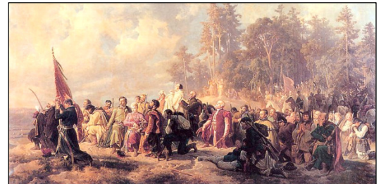
Artur Grottger painting: "Prayer of the Bar Confederates before battle of Lanckorona."

250 th Anniversary Confederation of Bar February 1768: After Russia stopped the Polish Sejm's planned reforms, Polish nobles (the szlachta) gathered in Bar in Podolia to support the independence of Poland from Russia. The Bar Confederation / Barska Konfederacja became a part of the fight for freedom