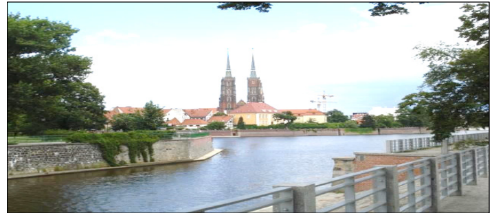
Picturesque Cathedral Island, Wrocław, Poland

Eight to nine WIESCO teachers selected from among applicants who apply online and meet educational and health requirements, will take part. A number of positions for student assistants of high school/junior college age, who likewise apply online , are also available. Daily camp experiences will be supplemented by afternoon and weekend excursions to noteworthy natural and historical sites in Poland.