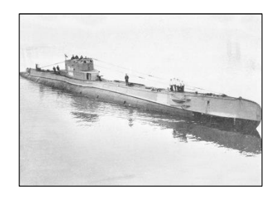
Public Domain photo: "submarine en:ORP Orzeł Polish in English port. Created 31 December 1939. Polish Goverment Press released 1940."