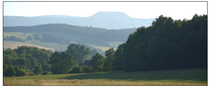
Picturesque Tabletop mountain and Lower Silesian countryside

in delivering over 4,200 person-hours of intensive classroomand activity-based English language training to approximately 500 new and returning Polish (and Czech) students, ages 8-18, plus smaller groups of adult learners, eager to extend and refine their English speaking skills. The goal is to help learners prepare for important life and career roles, including entry into institutes of higher technical training and academic learning in Poland and other European countries. In 2016, the Program was recognized by Polish educational officials at both the provincial and national levels.