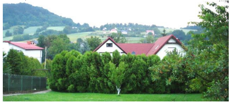
Scenic Nowa Ruda

A rural hamlet of some 1,600 souls located in the picturesque Table Mountains that straddle southwestern Poland and the Czech Republic, tiny Bożków is located in the scenic Kłodzko (KWAT sko) Valley, near the town of Nowa Ruda – part of the Polish province of Lower Silesia, 47 miles from Wrocław.