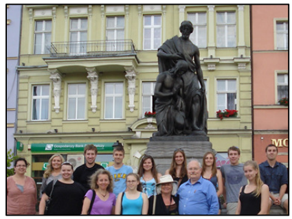
nearby town of Kłodzko WIESCO teachers excursion to Nowa Ruda

In return, housing and meals are fully provided to WIESCO staff during their stay. Each staff member, teacher or assistant, pays his/her airfare to/from the point of departure/return, with ground transportation in the host country provided by the host institution. Hosts also sponsor excursions for WIESCO staff to sites and events of cultural, historical and/or natural interest during and after the camp, as a means of recognizing the volunteer nature of the staff, helping to build rapport, deepening staff appreciation for the host country, and improving