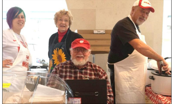
9 Jan. Dziękuję to all International Festival helpers!