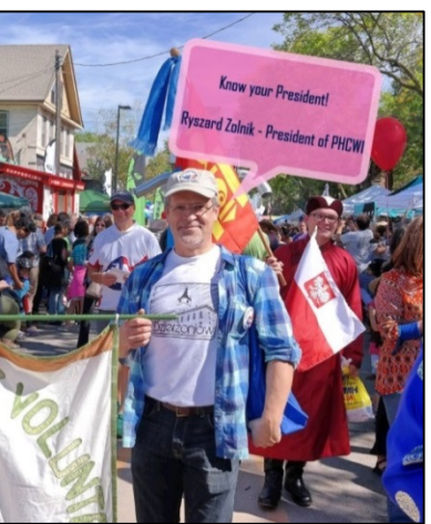
Sept 20. PHCWI at the Willy St Fair A beautiful sunny day at

the one-and-only Willy Street Fair was enjoyed by all. The club's first time at the fair booth was well staffed, and many stopped by to chat and view Polish items. Thank you to the organizers & helpers!