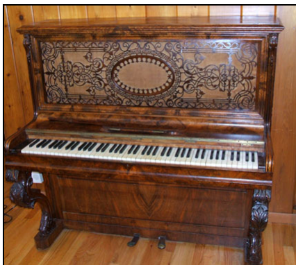
1840 English Upright Piano

"On Sunday February 13 I'll give a recital of piano works Chopin & Schubert. The featured instruments will be the Victorian English Parlor Grand and our beloved English Cottage Upright "Fred." I'll play and discuss selections from Chopin's Nocturnes Op. 9 , and some of the Mazurkas and Preludes. Schubert works include the Three Piano Pieces (D. 946) , and selections from the Impromptus and Moment Musicaux . I will also talk about the historical tunings used on these pianos, forms of Well Temperament, and I'll discuss how temperament is related to key color. We hope you can join us!"