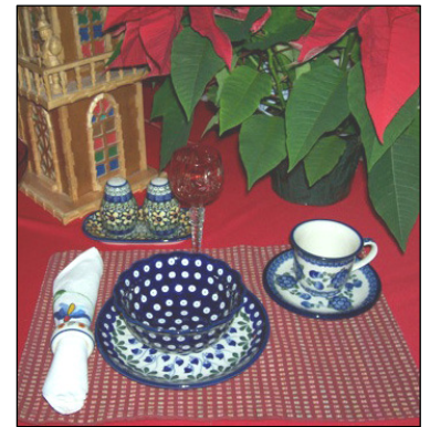
Boleslawiec Stoneware for the Uninvited Guest (bowl-eh-suave-ee-ets)