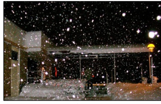
the Zor Temple entrance