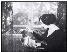
Wikipedia commons public domain photograph from a Moscow newspaper published in 1907