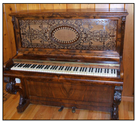
1840 English Upright Piano

"On Sunday February 13 I'll give a recital of piano works Chopin & Schubert. The featured instruments will be the Victorian English Parlor Grand and our beloved English Cottage Upright "Fred." I'll play and discuss selections from Chopin's Nocturnes Op. 9 , and some of the Mazurkas and Preludes. Schubert works include the Three Piano Pieces (D. 946) , and selections from the Impromptus and Moment Musicaux . I will also talk about the historical tunings used on these pianos, forms of Well Temperament, and I'll discuss how temperament is related to key color. We hope you can join us!"